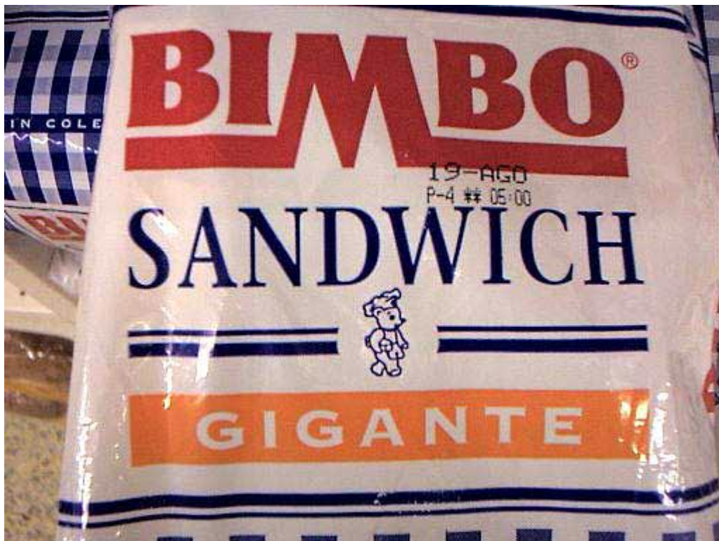
A bimbo sandwich sounds good right now.