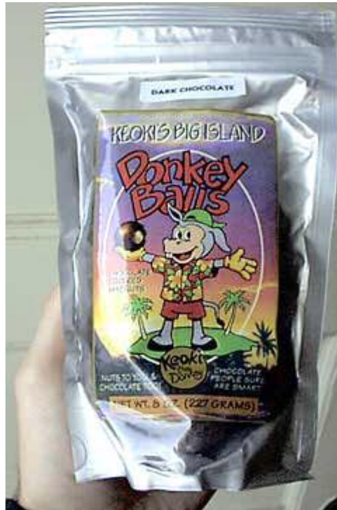
Donkey balls. In dark chocolate.