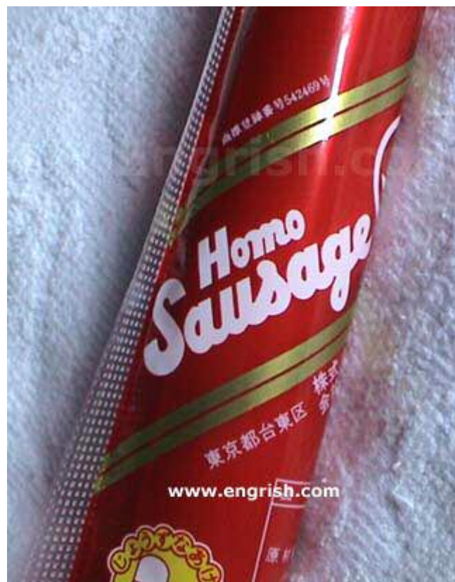
A Japanese favourite, apparently.